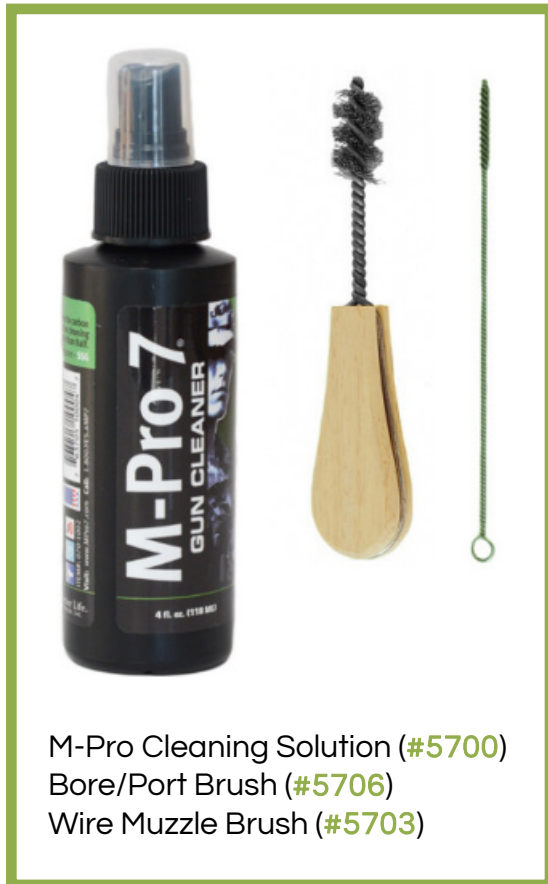
M-Pro Cleaning Solution (#5700) Bore/Port Brush (#5706) Wire Muzzle Brush (#5703)