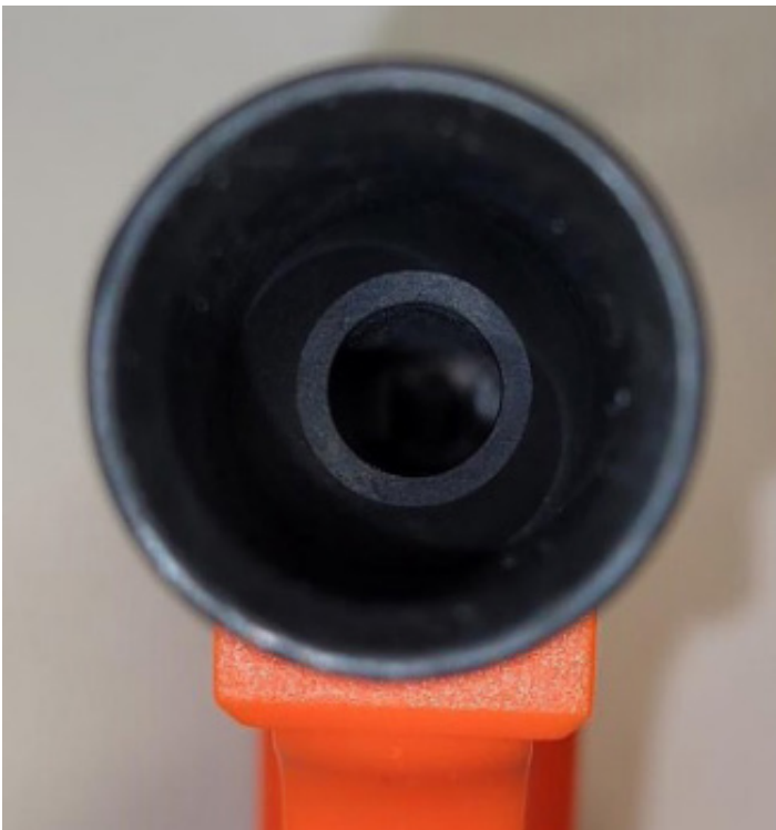
Clean Muzzle Cup

The Muzzle Cup can be cleaned by using a Wire Muzzle Brush (#5703) and M-Pro 7 ( #5700 ). It is very important this area of the launcher is kept clean. Pyrotechnics should NEVER fit snugly. Pyro cartridges should always be loose to ensure proper flight.